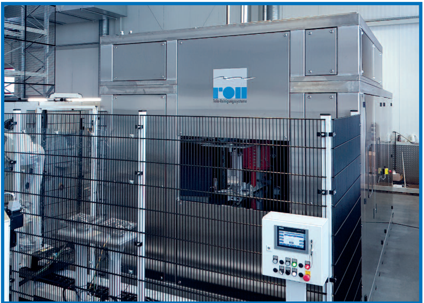
Round cycle facility type RUN