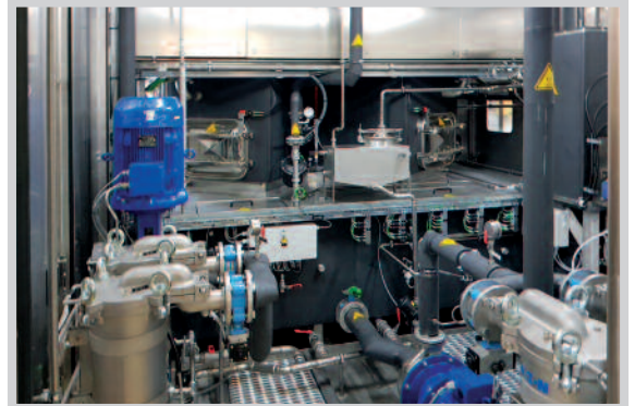
RUN interior view

Cleaning and degreasing facilities for aqueous media, halogenated and nonhalogenated solvents.