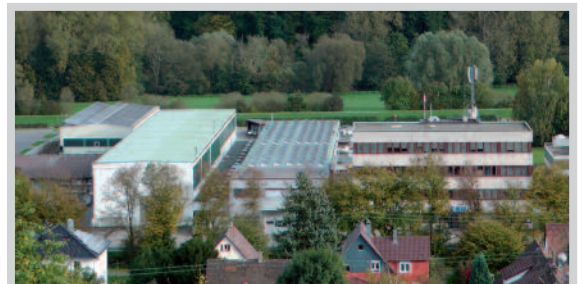
Our factory premises in the Enz Valley